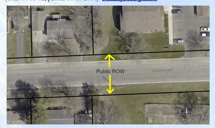
Example of a Road Right-of-Way (ROW):

fere with access to or use of the easement.